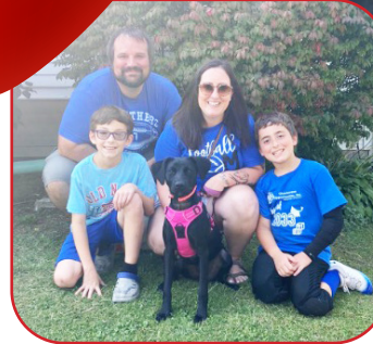
Bunny and her new family!

Wyatt and Ash were so fortunate to be adopted together by their "forever" family. They loved Wyatt instantly but were not too sure about Ash as he was very timid and fearful. Understanding that some cats are shy because of past trauma, they decided to take a chance that with some love and affection, plus a little bit of guidance from Wyatt, he would come around. It took a number of weeks, but Ash is now much more confident, happy, and trusting of the family that adores him.